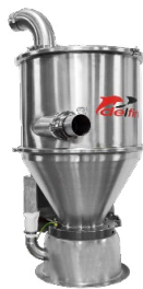
PNEUMATIC CONVEYING SYSTEMS