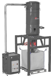
CENTRAL VACUUM SYSTEMS