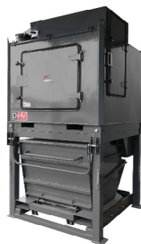
ENGINEERED AND CUSTOMIZED SOLUTIONS