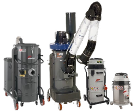
PORTABLE VACUUMS FOR INDUSTRIAL CLEANING

We are a global leader in the manufacturing of industrial vacuum machines, ranging from portable vacuums for industrial cleaning, to central vacuum systems and engineered solutions to pneumatic conveying systems.